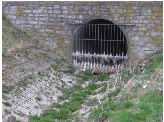
Unsightly matter discharged during storm events, typical for stormwater discharges without coarse material retention.

On the basis of the DWA sheet A 102 (an instruction issued by an association dealing with wastewater treatment) efforts to fundamentally improve the protection of waters in this sector have been increased. Particularly endangered receiving water courses and nature preservation areas require more extensive measures concerning the treatment of stormwater.