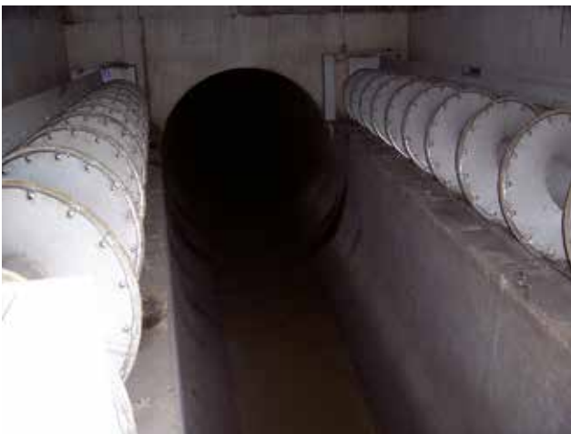
ROTAMAT® RoK1 screens installed at an angle of 60° on both sides of an overflow.