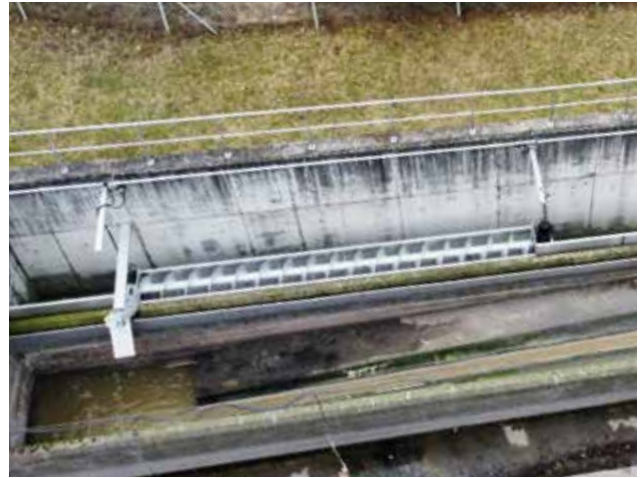
HUBER Storm Screen ROTAMAT® RoK1 TS with a cross conveyor for high solids loads.