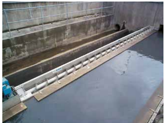
HUBER ROTAMAT® Screen RoK1 installed in a stormwater discharge channel.