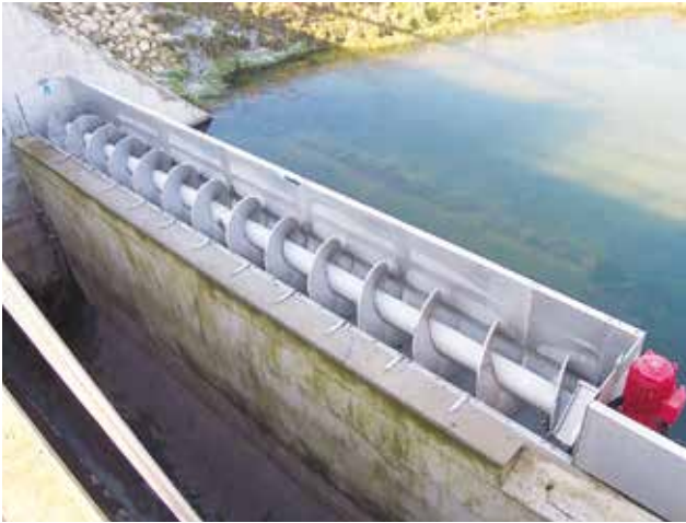
ROTAMAT® Storm Screen RoK1 installed at an overflow weir.

A selection of installation examples will convince you of the HUBER ROTAMAT® Storm Screen RoK1: