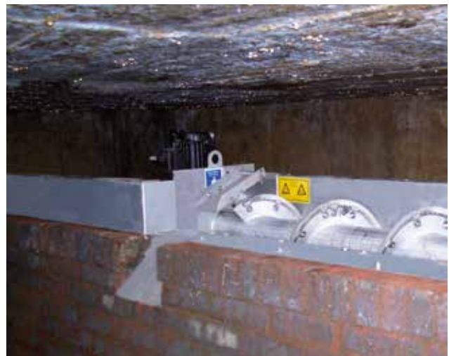
Return of screenings into the sewer.

RoK1 screens are horizontally installed at the downstream side of overflow weirs. A screw flight is mounted on a half cylinder of perforated plate. As the stormwater flows through the horizontal perforated half-pipe of the screen trough the solids are retained. A screw, with a brush attached on its flights, rotates within the semi-circular screen trough. It cleans the screen and pushes the screenings gently towards the end of the trough. At the end of the trough, the screenings are returned into the sewer and carried to the wastewater treatment plant. Alternatively, the screenings are removed from the plant with a cross conveyor for further disposal. During storm conditions the screen is automatically started and then works fully automatically.