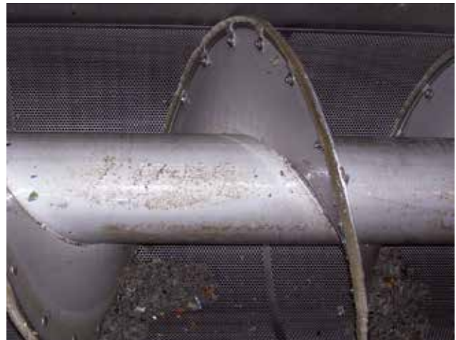
Gentle automatic cleaning of the semi-circular perforated plate.

The ROTAMAT® RoK1 screen is the ideal solution for this task, whether for new structures or refurbishment. The screen belongs to a group of fine screens designed for high flow rates at an extremely low hydraulic resistance. Two-dimensional screening guarantees a very high solids retention combined with automatic, gentle cleaning of the perforated plate.